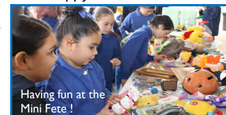
Having fun at the Mini Fete!