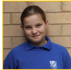
I liked that the country team won the game. - Violet W