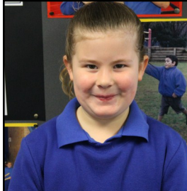
Go to the park down the road Leticia W