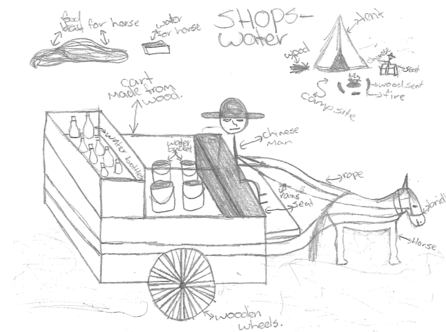
An old water transport cart

We are about to embark on a study of THE EUREKA STOCKADE and how this event helped to change Australian Democracy, as well as learning about Ned Kelly before heading on our excursion to Glenrowan and Beechworth.