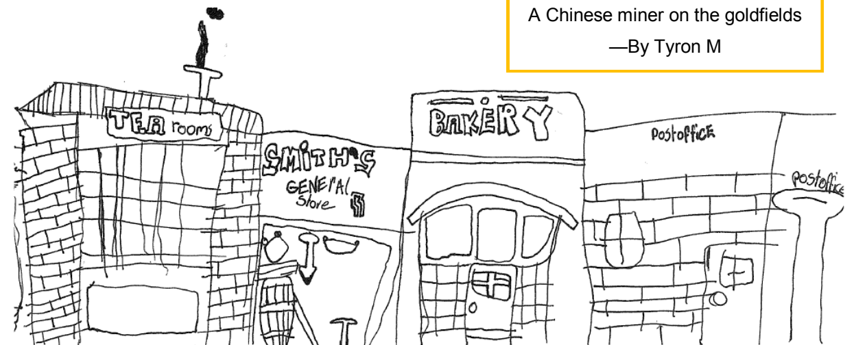
An old street scene—By Ben P