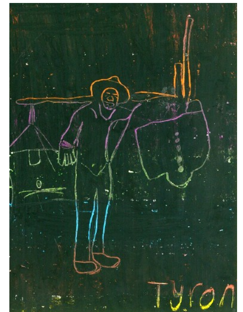
A Chinese miner on the goldfields