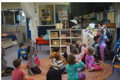
PS1 enjoying a story